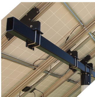
Underside of Multi-Pole Mount