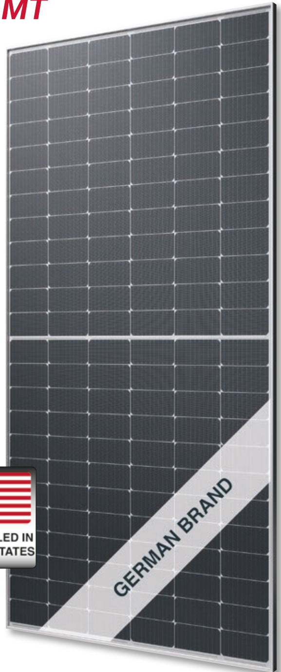
Fig. similar 144MHUSA240429A